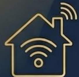
Smart Home System